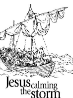
Jesus calming the storm

I am once again filled with Spirit and firmly planted on solid ground. “